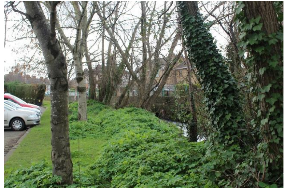
Plate 10-12: View 2 of dense trees and vegetation along riverbank at St. Martin's Drive