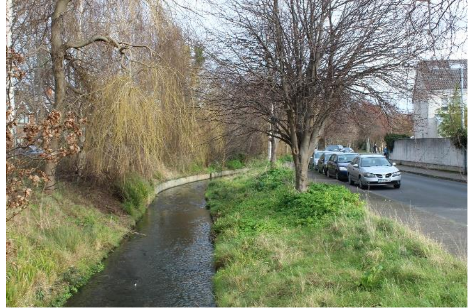
Plate 10-15: View 2 of Poddle corridor at Mount Argus Close