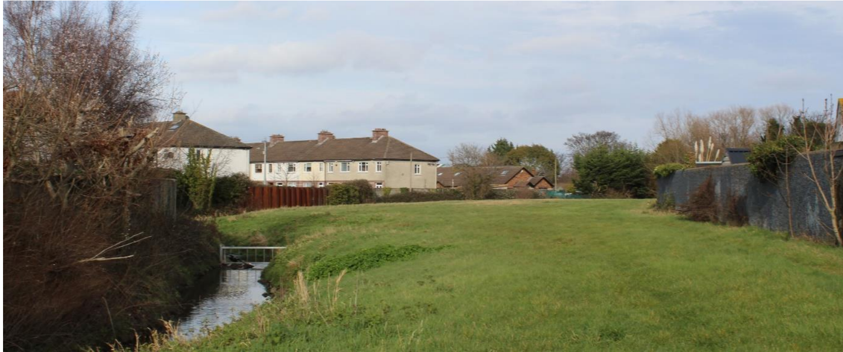
Plate 10-6: River Poddle in open green space north of Templeville Road