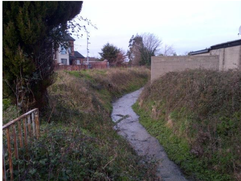
Plate 10-5: View 2 of open grass lined channel from west of Wellington Lane