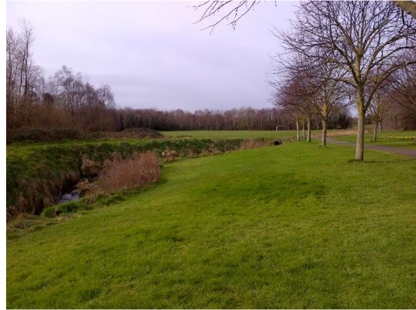
Plate 10-2: Open River channel in grassland at Tymon Park