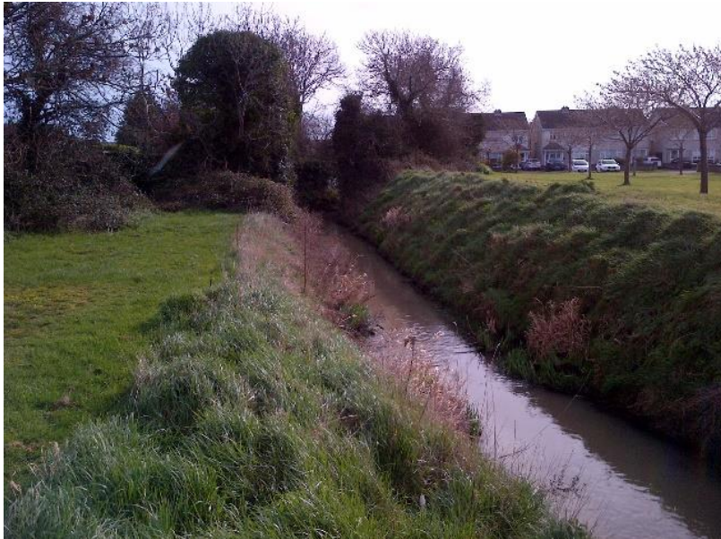
Plate 10-4: View 1 of open grass lined channel from west of Wellington Lane