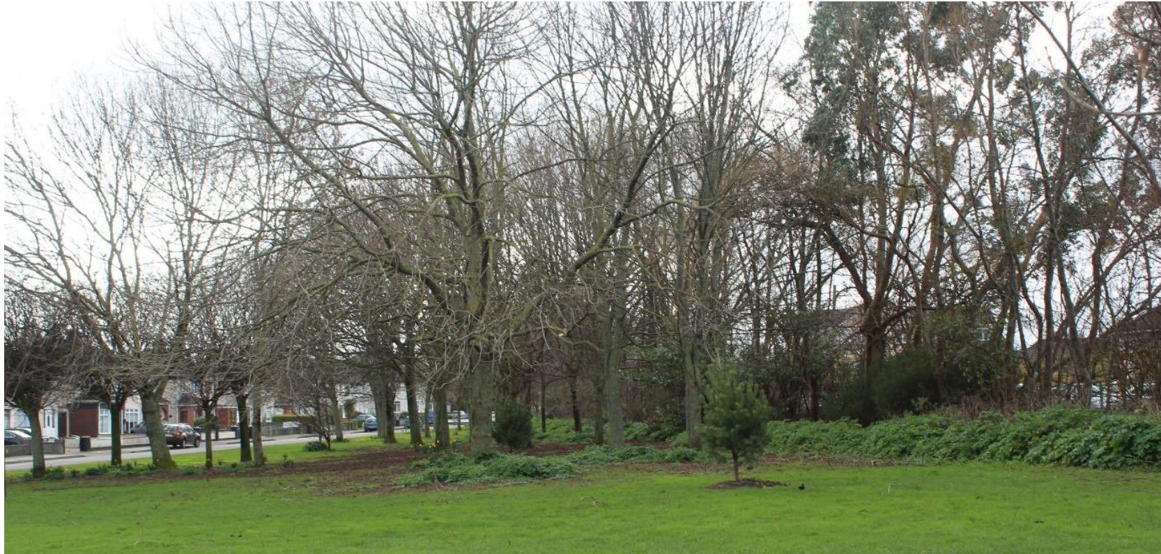
Plate 10-13: Mature trees and undergrowth and grass create enclosure give a sense of naturalness along the river corridor