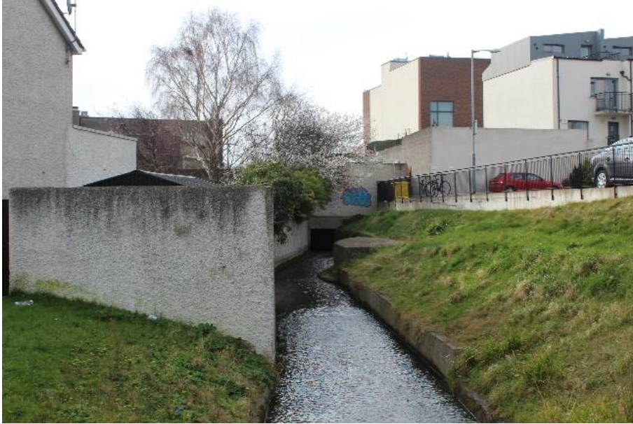
Plate 10-14: View 1 of Poddle corridor at Mount Argus Close