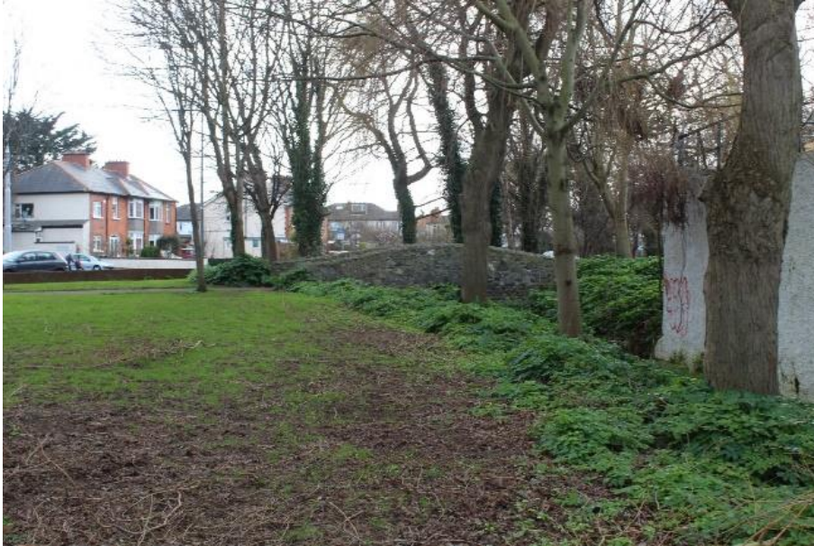
Plate 10-7: View 1 of Bridge, wall and trees in southern end of Ravensdale Park