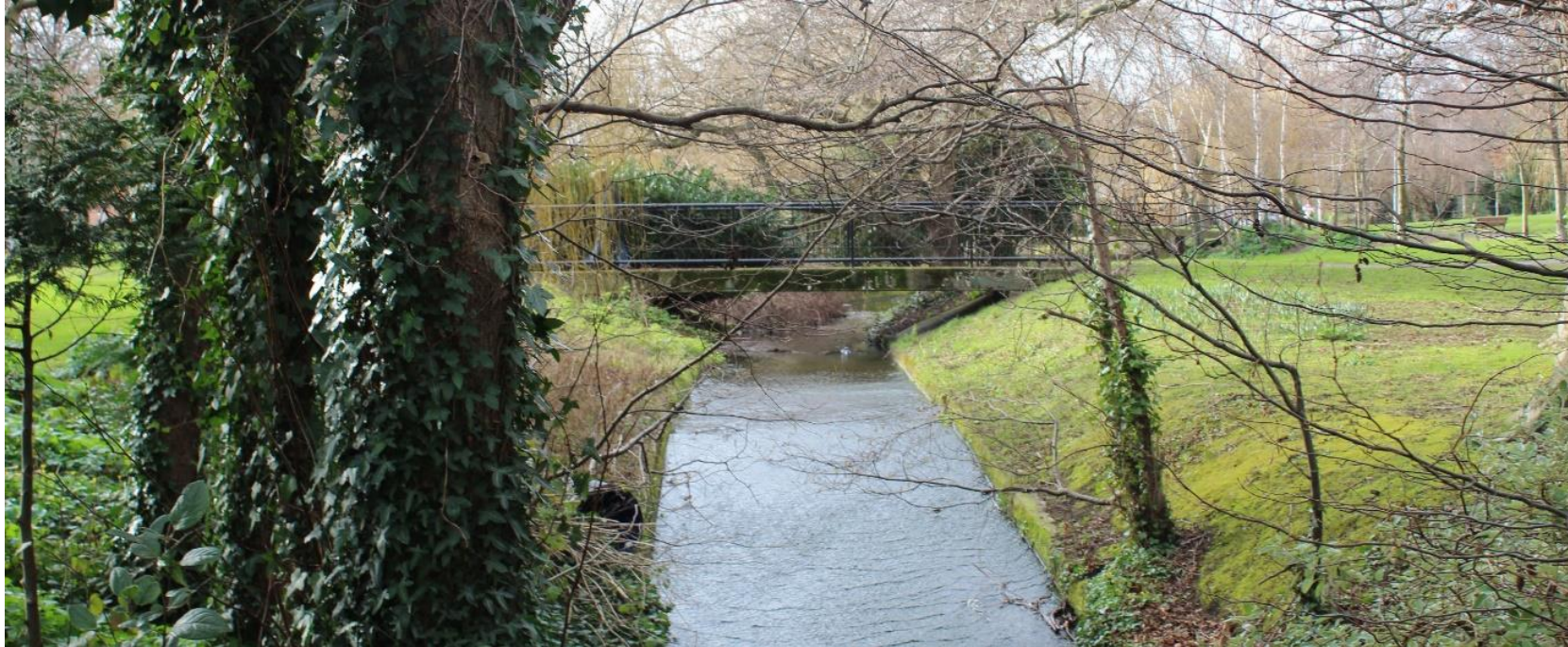
Plate 10-16: River flows through grass with some trees on bank at Mount Argus Church Grounds