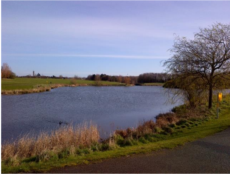
Plate 10-1: Lake, grassland and trees in Tymon Park