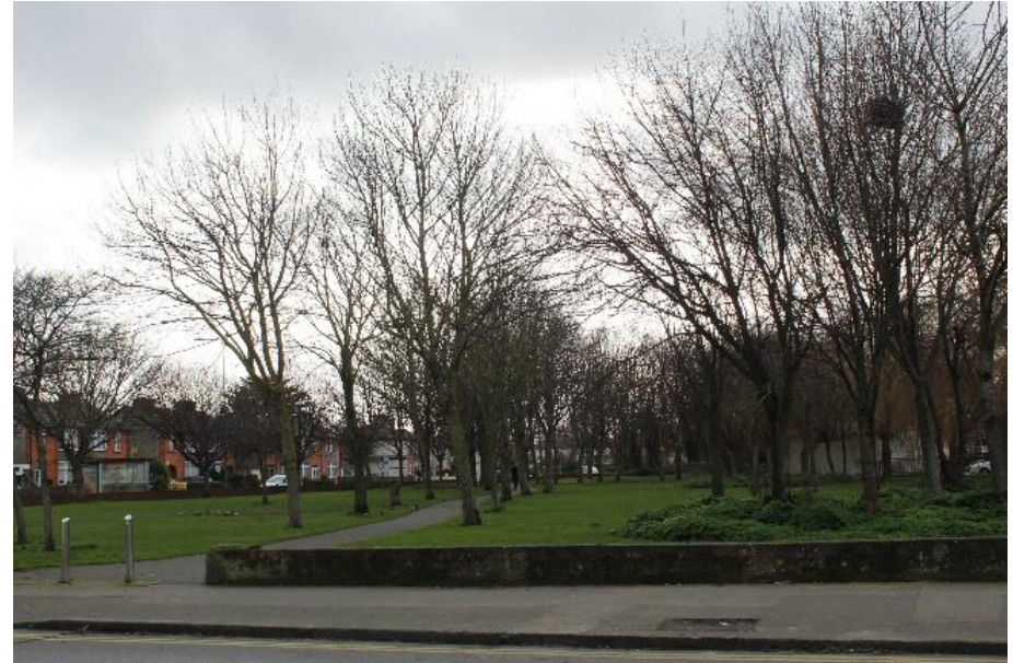
Plate 10-10: Mature trees and grass with low enclosing wall at Ravensdale Park