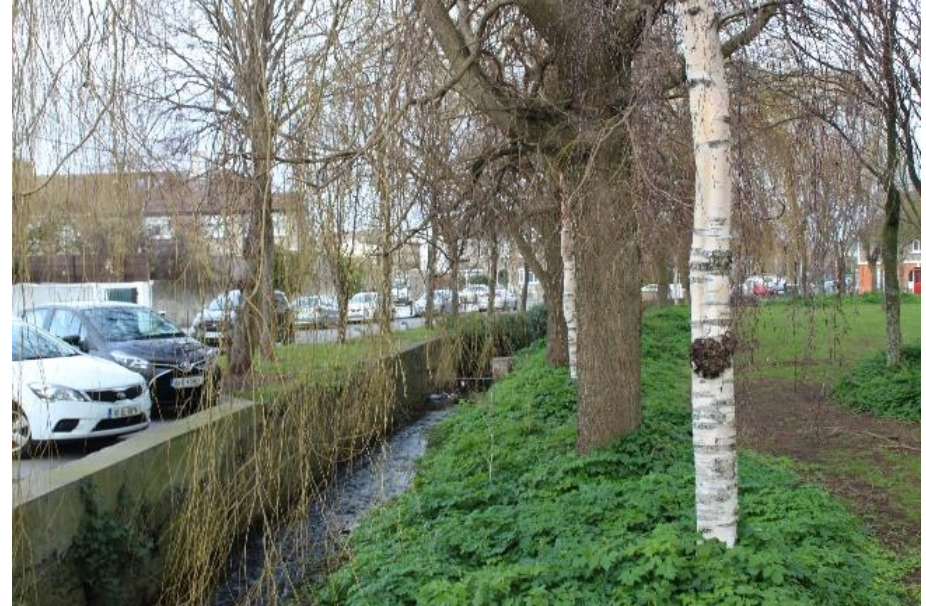
Plate 10-8: View 2 Bridge, wall and trees in southern end of Ravensdale Park