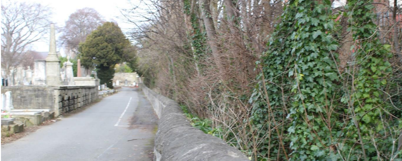
Plate 10-17: Wall contains river with dense vegetation along bank at Mt Jerome