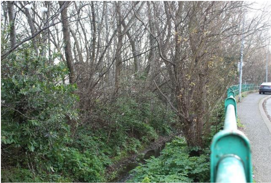
Plate 10-11: View 1 of dense trees and vegetation along riverbank at St. Martin's Drive