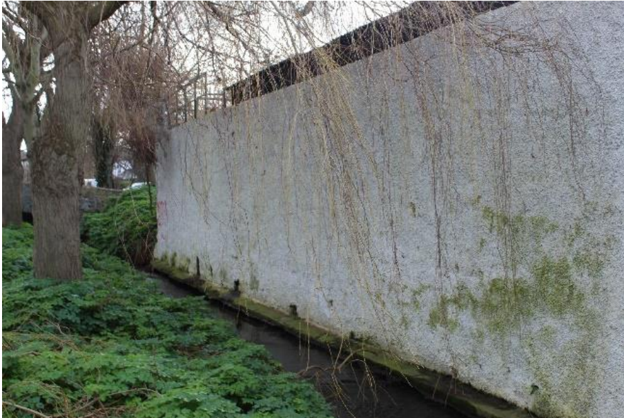
Plate 10-9: High concrete wall at Ravensdale Park