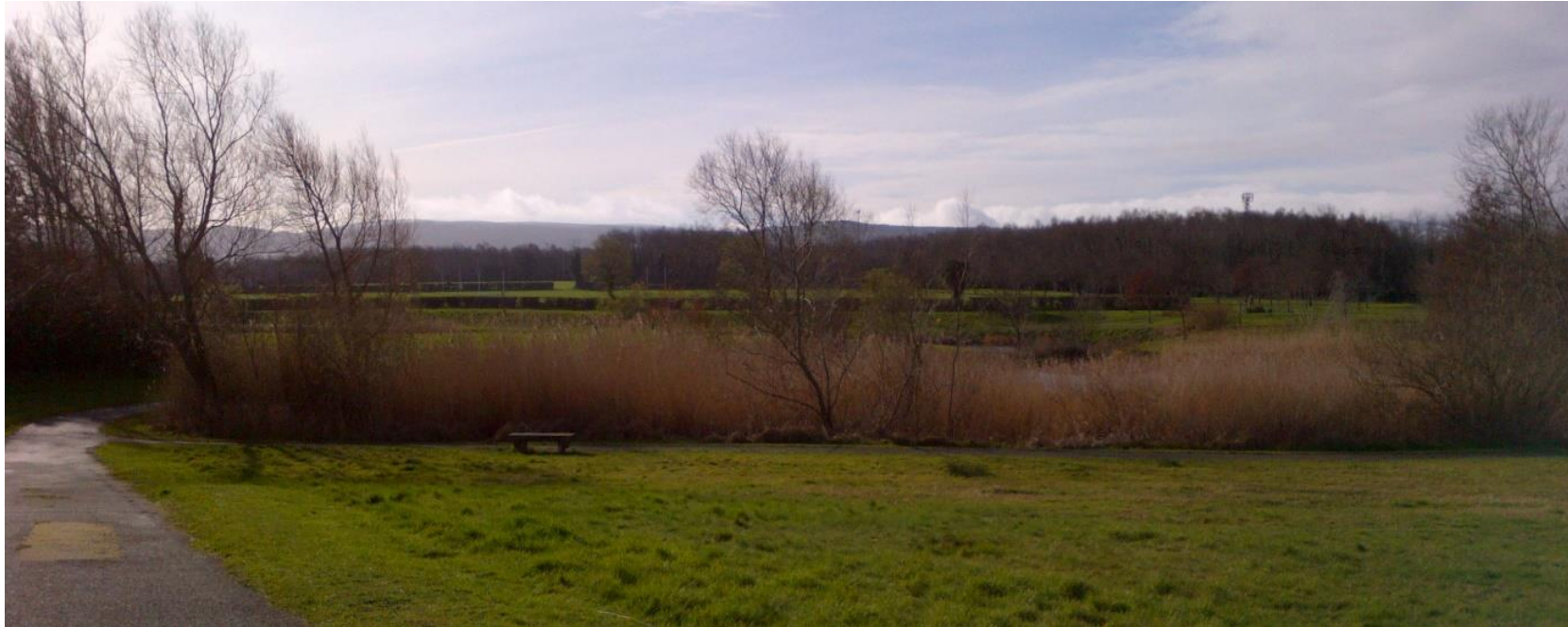
Plate 10-3: Topography slopes towards the lakes south of Limekiln Road